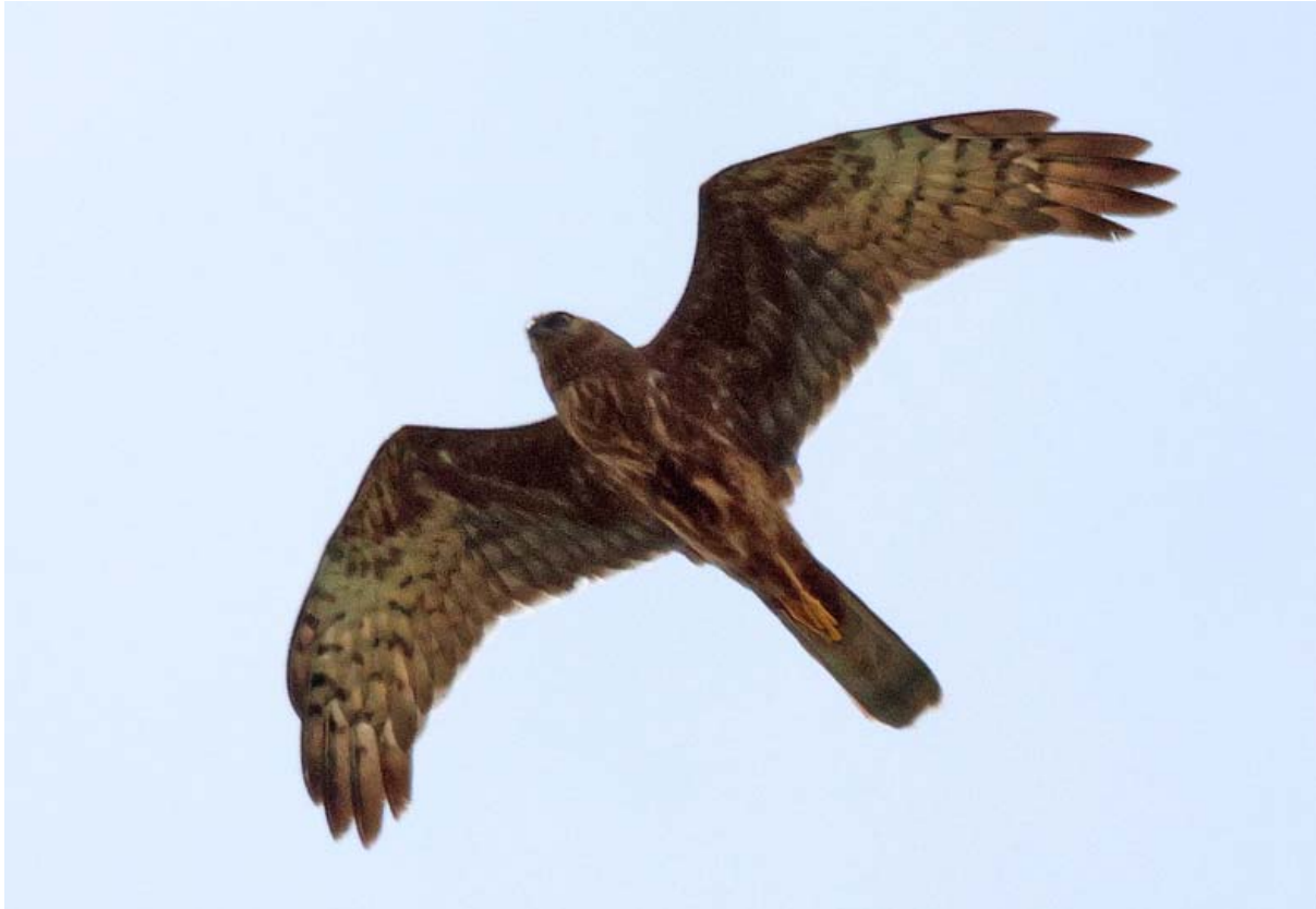
Pied Harrier, at Tuas South Link 4, 6 Nov 2022

As the scheduled date for the 15th Singapore raptor watch was rained out, a count was organized the next day, albeit for a shorter 4-hour duration. The exception was Telok Blangah Hill Park which was counted on 10 Nov 2022, and the team at Tuas View Drive soldiered on in the rain on the original date.