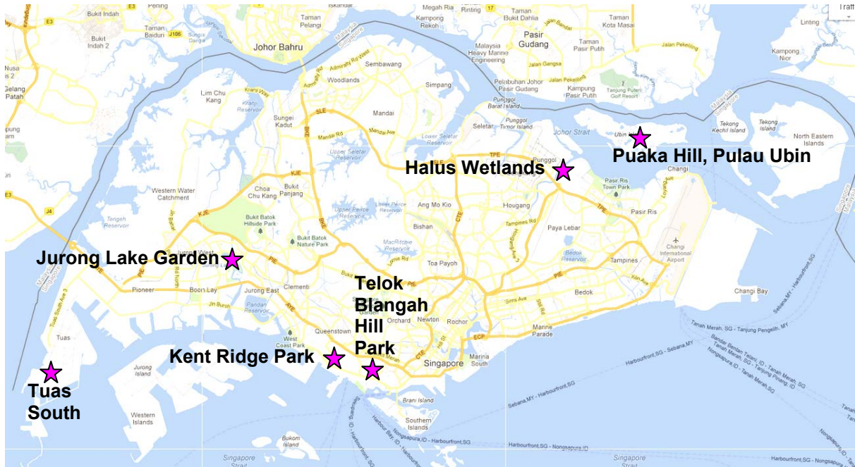
Figure 1 : 2022 Raptor Watch Sites.

Our usual sites are Tuas South, Jurong Lake Garden, Kent Ridge Park, Telok Blangah Hill Park, Lorong Halus Wetlands, and Puaka Hill, Pulau Ubin – thanks to all the site leaders for their faithful support!